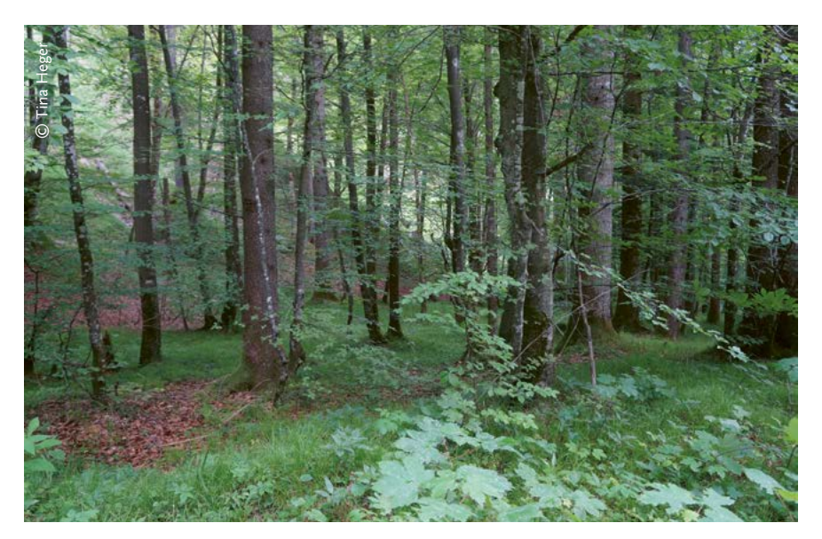
FIGURE 2: A near natural beech forest (on the left) and an abandoned urban industrial site colonised by birch trees, which is now used as a park (below; see also https://www.natur-park-suedgelaende.de/en). The resemblance between the two is striking, however one is considered pristine and natural. while the other is deemed unnatural. These differences raise questions such as: Who is responsible for these changes – both in the past, and going forward? Is this altered state desirable? etc. It illustrates that cultural meanings and moral commitments towards nature following human interventions are altered, and this affects the assumed relations of care and responsibility.

involved in the production of novel natures, and the need to attend to their emergent and unexpected effects (Latour 2012, 2016). It suggests that conservation and restoration efforts can be rethought as involving both "ecological and political uncertainty" (Braun 2015, p. 109), and that environmental management can open itself up to surprise and unexpected developments through more adaptive and open-ended approaches (Carver et al. 2021). Feminist and decolonial scholars, informed by Indigenous perspectives, have emphasised the need for a deep time perspective of care and responsibility for novelty in nature, which includes what came before, what