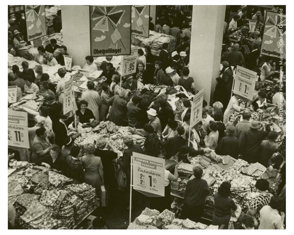
FIGURE 1: Summer sale at the Oberpollinger department store in Munich. 1950s: In the mid-20th century, consumption became a key economic driver. Economic growth was seen as a solution for political and social conflicts, closely linking individual freedom with the right to consume. Given this mindset and the reality of planetary boundaries, the question is whether liberal democracies can thrive with limits on consumption.

A core element of the concept of CCs is the distinction between universalist needs and subjective desires . Definitions of both, as noted above, suggest that those who adhere to high-consumption satisfiers are primarily influenced by "the media or what we might have been brought up with or taught to believe" (Fuchs et al. 2021, p. 47). This argument implies that people can emancipate themselves from this imposed "endless creation of artificial desires" (Brand et al. 2021, p. 276) towards "the very essence of autonomy ", that is, "exercising restraint by imposing rules upon ourselves" (Fuchs et al. 2021, p. 69). In liberal thinking, self-